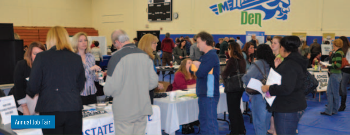
Annual Job Fair