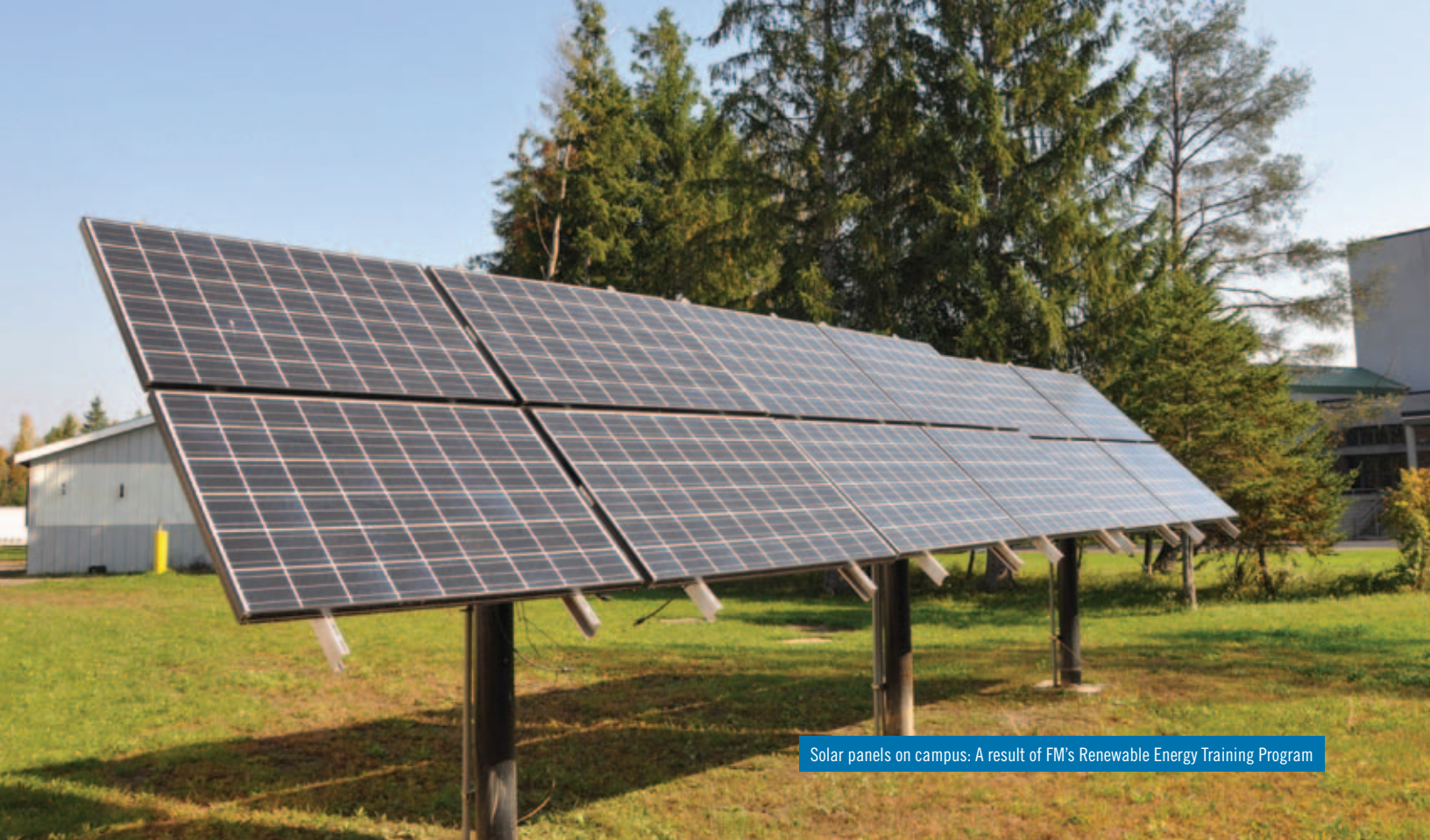
Solar panels on campus: A result of FM's Renewable Energy Training Program