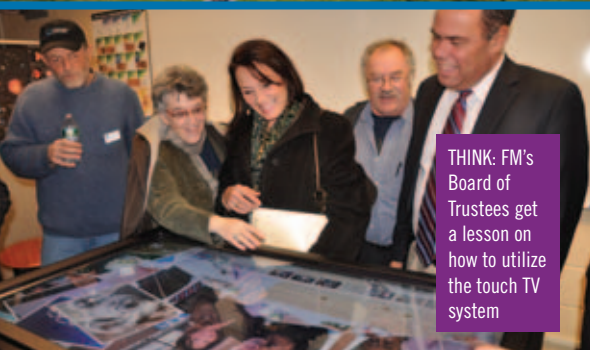
THINK: FM's Board of Trustees get a lesson on how to utilize the touch TV system