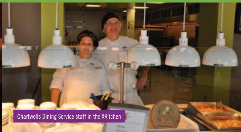
Chartwells Dining Service staff in the XKitchen