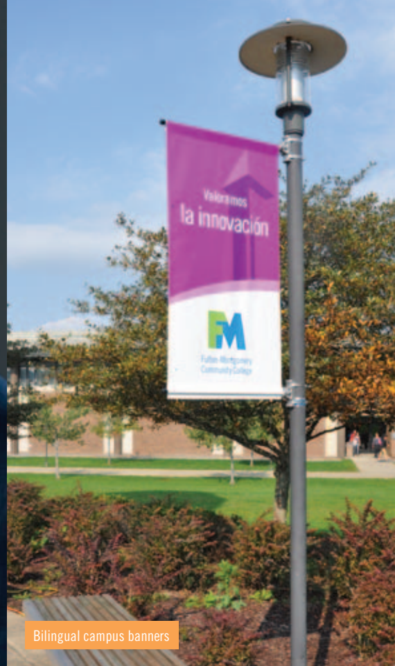
Bilingual campus banners

I am very pleased to present to you the 2011-12 Annual Report for Fulton-Montgomery Community College. Once again our faculty, staff, and students have demonstrated that FM is truly a great college.