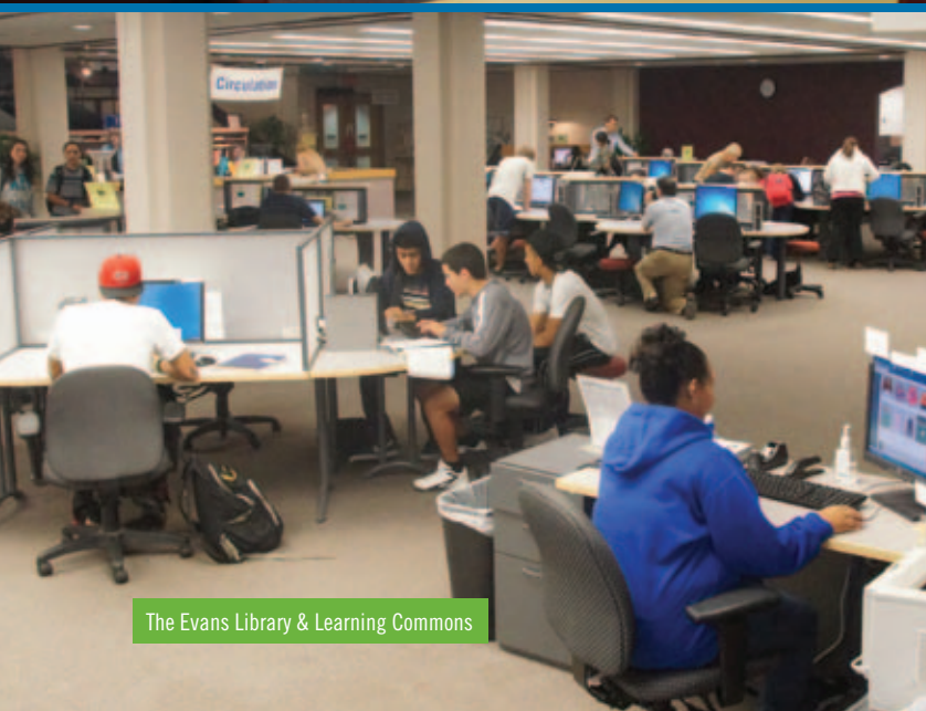
The Evans Library & Learning Commons