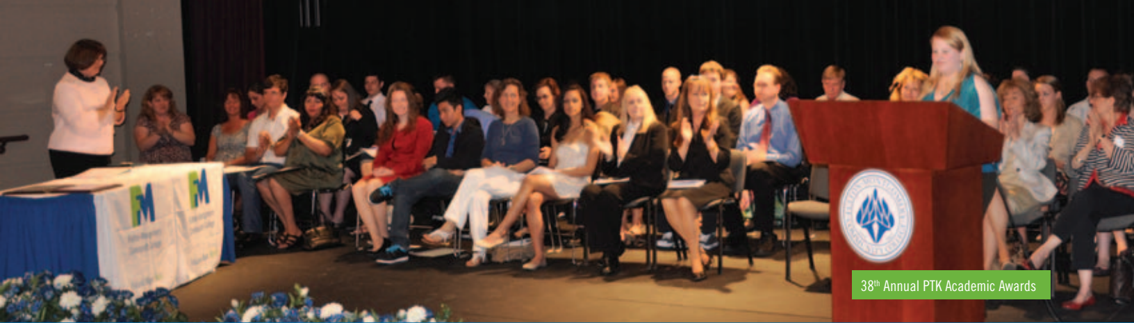
38th Annual PTK Academic Awards