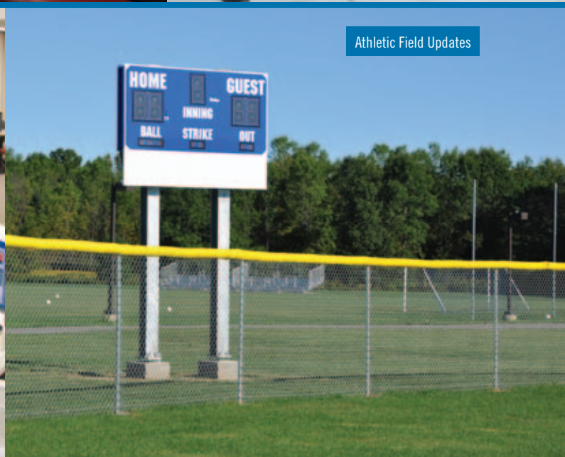
Athletic Field Updates