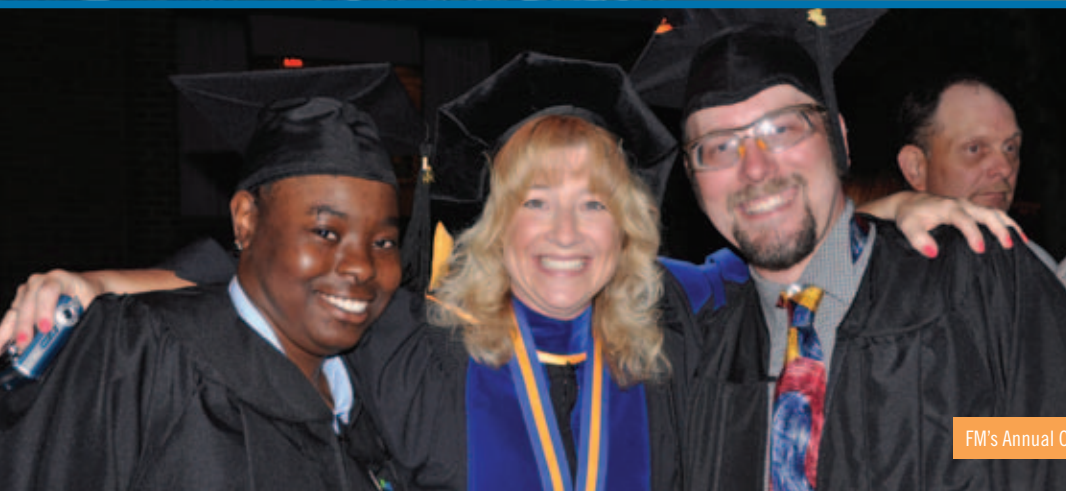
FM's Annual Commencement