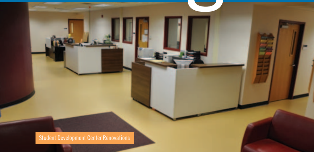
Student Development Center Renovations

Preparing us for future growth and innovation.