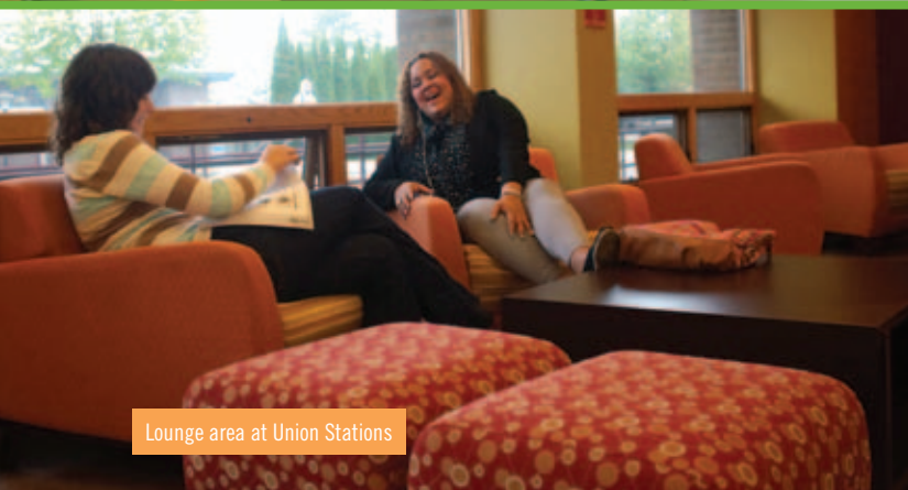
Lounge area at Union Stations