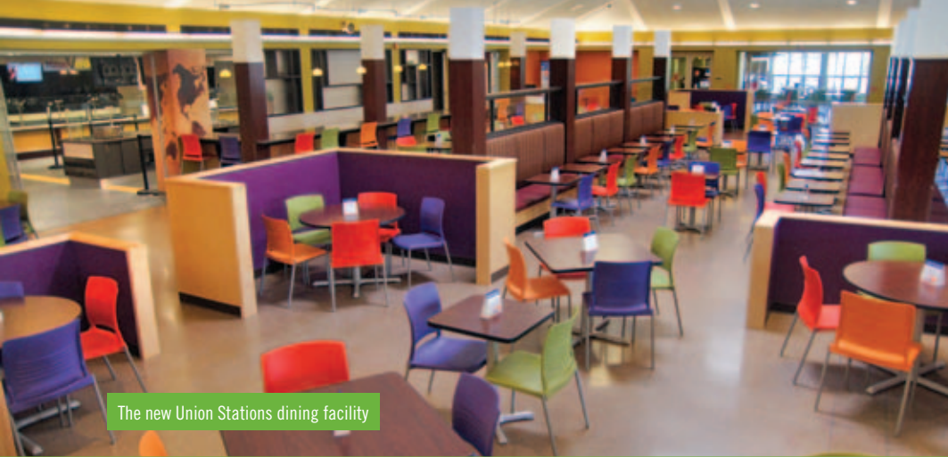
The new Union Stations dining facility