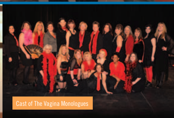
Cast of The Vagina Monologues

and his family continue to advocate on behalf of their daughter and transgender youth everywhere.